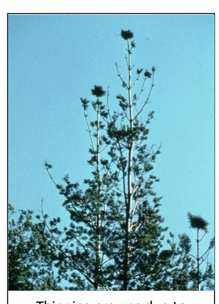
Thinning crowns due to pine shoot beetle damage

More than 20 years of research, regulation and management experience in the U.S. is available upon which to draw guidance for regulating and managing PSB in Missouri. However, we have some unique challenges. Missouri is located on the southern edge of the PSB range in the U.S., although PSB's distribution worldwide extends to more southern latitudes elsewhere. As the PSB expands its range farther south here, it is unknown how much the warmer climate will affect its biology and the annual timing of management activities. It is also unknown how PSB will behave when it enters the range of shortleaf pine ( P. echinata ) in southern Missouri and beyond. Studies in Ohio confirm that PSB can reproduce in shortleaf pine logs and