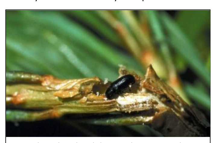
Pine shoot beetle adult tunneling in pine shoot

But unlike most bark beetles, PSB also has a shoot tunneling period during the adult stage. It is a primary colonizer for shoot tunneling, because it readily attacks healthy pines. Where there are severely stressed or recently dead pines in which PSB populations can build, the beetles can