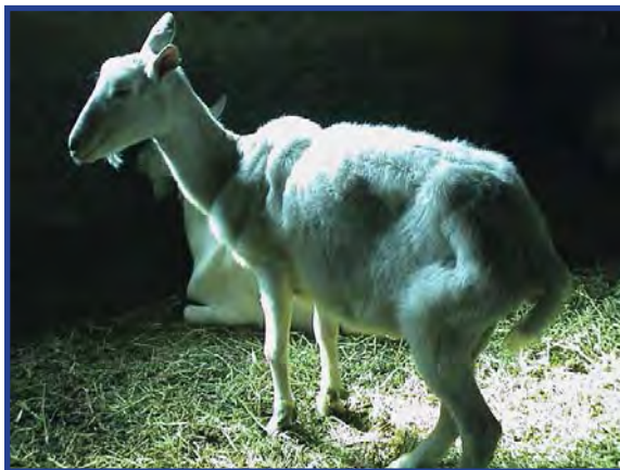
A goat showing symptoms of Johne's disease.

When an animal with signs of Johne's disease is discovered, it is very likely that other infected animals—even those that still appear healthy—are in the herd. Control of the infection requires that you and your veterinarian address it in the whole herd and not just on an individual animal basis.