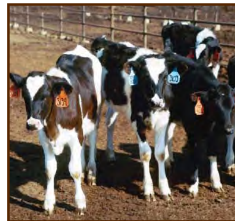
When expanding its herd, Moserdale Farm purchased calves only from known sources with known best management practices.

Editor's Note: This information is provided as a service to readers and is not intended as an endorsement of any product.